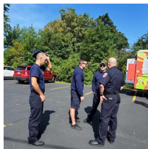
Our local Emergency Services were invited to have lunch with us!