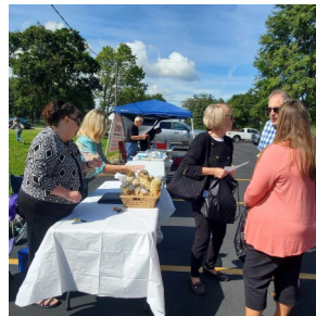
Enjoying the day!